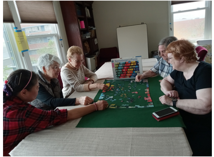
Snapshots from Thursday's Bible Study Social Gathering