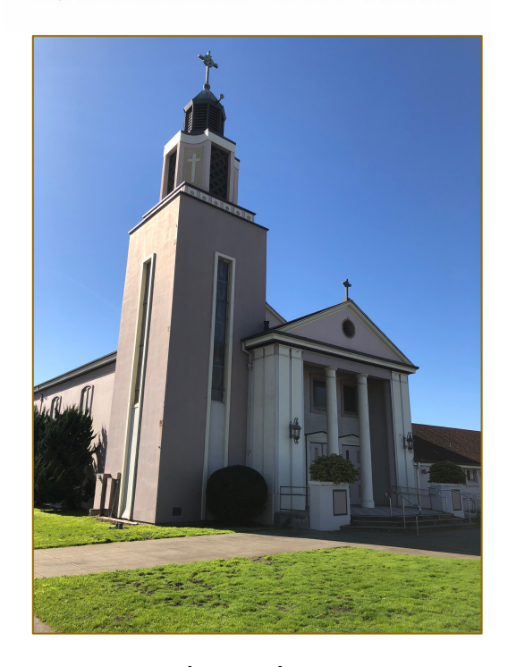
Join us each Sunday at 11 a.m. for worship.

Back to Church Sunday – September 11 World Communion Sunday – October 2 Reformation Sunday – October 30